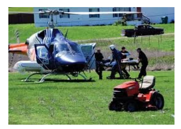
Gibson Field Update By Graham Tattersall

NO FLYING while mowing is in progress !!