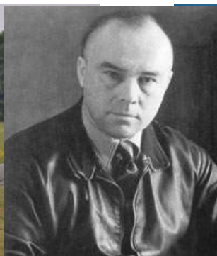
Nikolay Polikarpov (1892-1944)